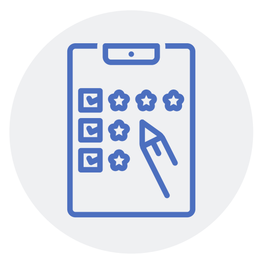
Applying to College