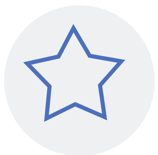
Scholarhips & Financial Aid